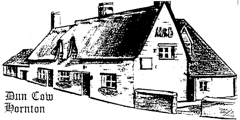
Dun Cow Hornton